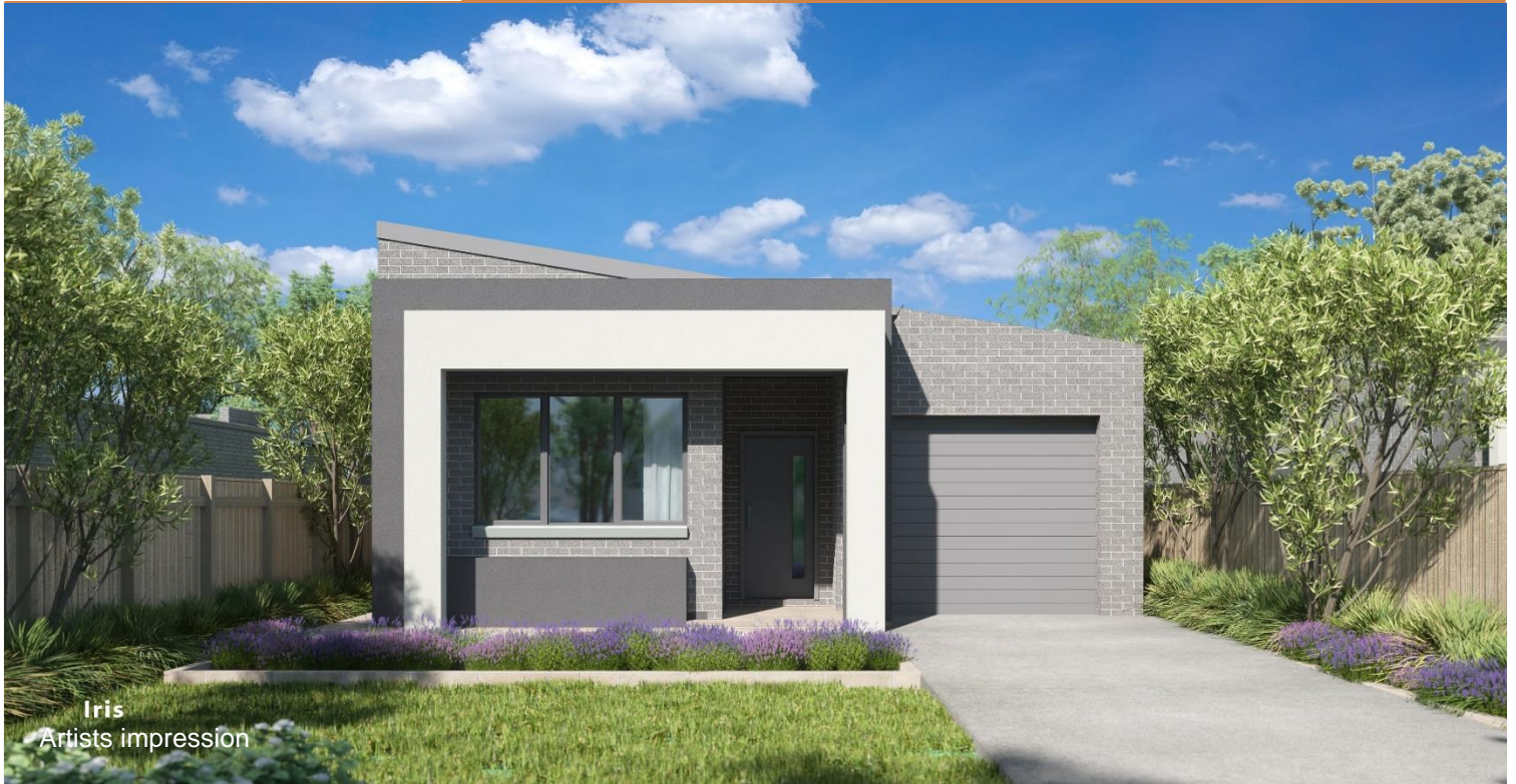
Iris Artists impression