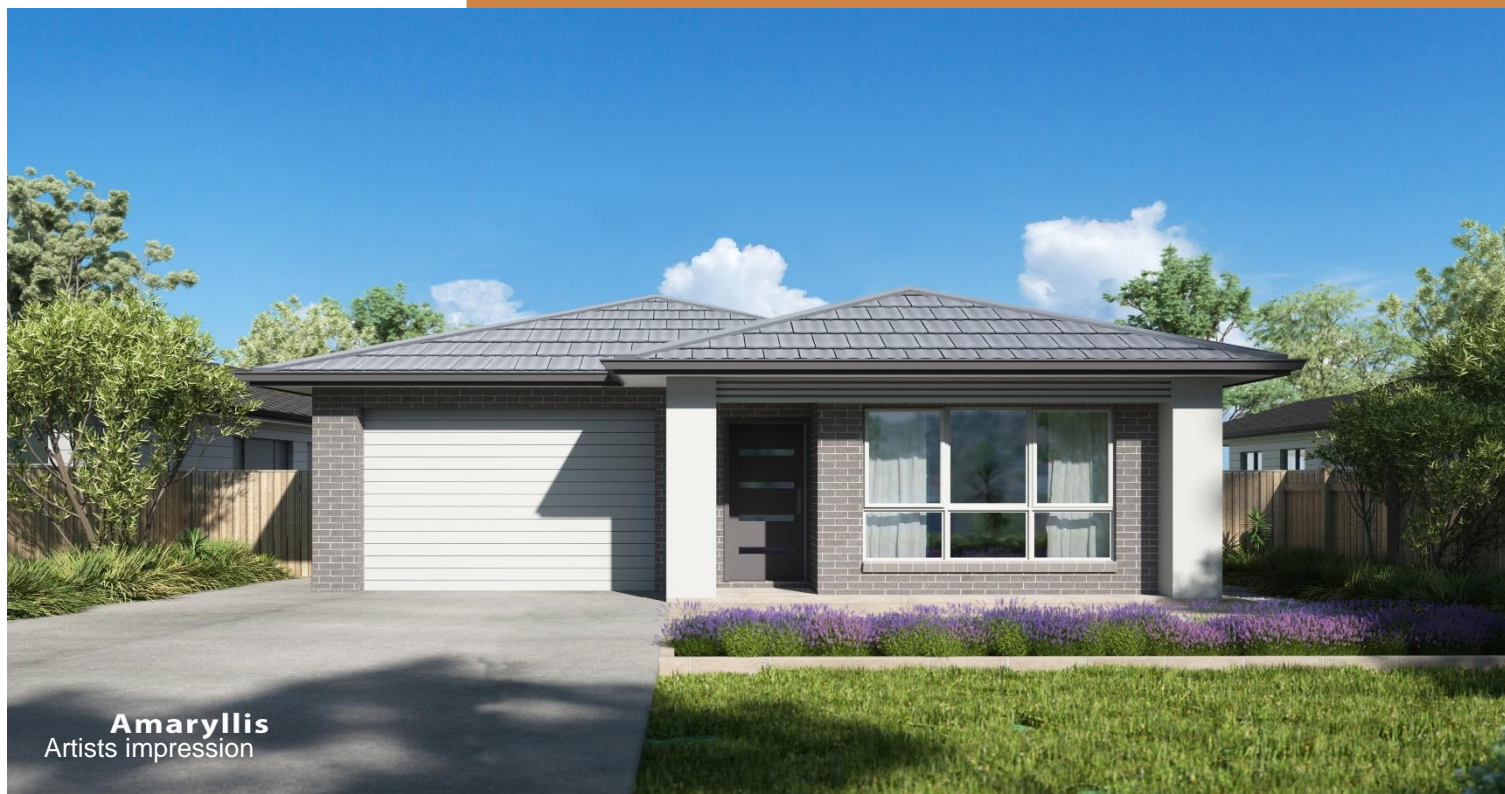
Amaryllis Artists impression