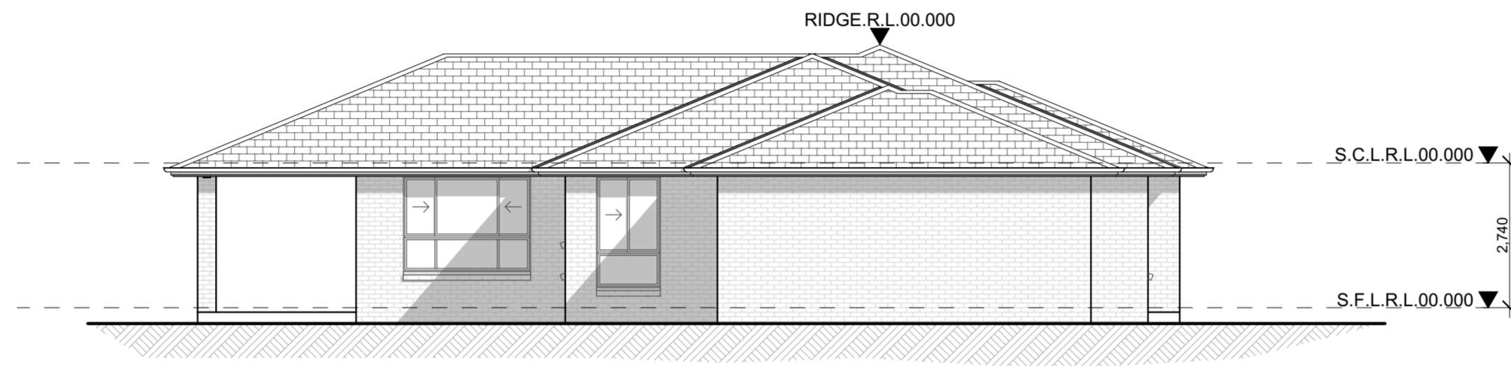
○ Side Elevation Elevation 4 scale 1:100