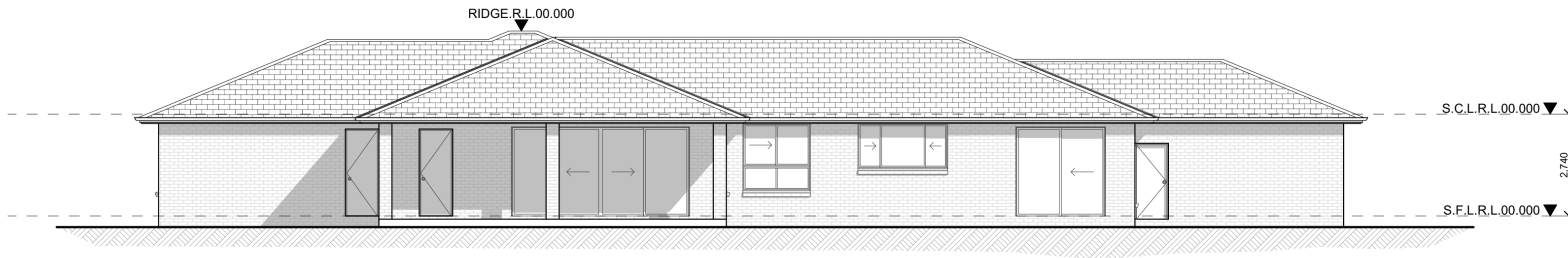
○ Rear Elevation Elevation 3 scale 1:100