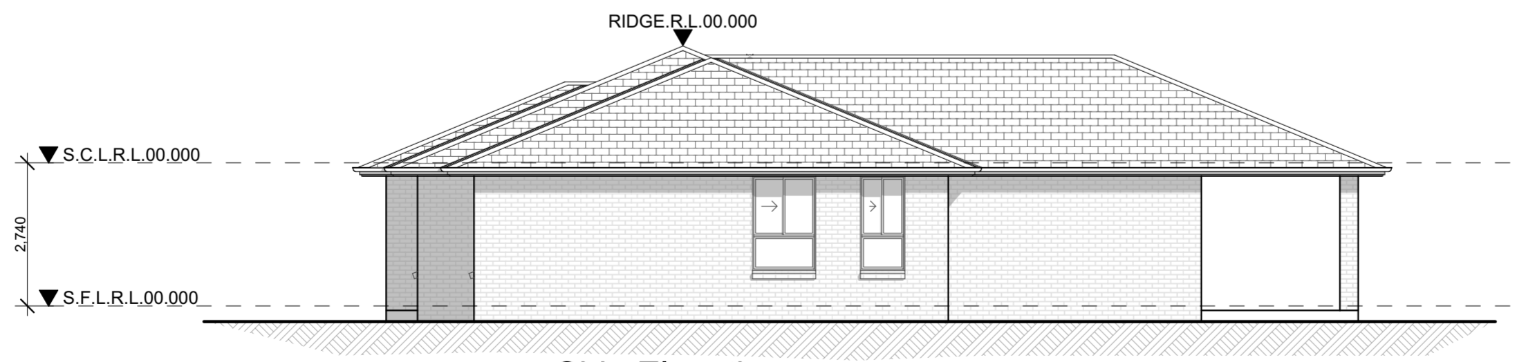
○ Side Elevation Elevation 2 scale 1:100