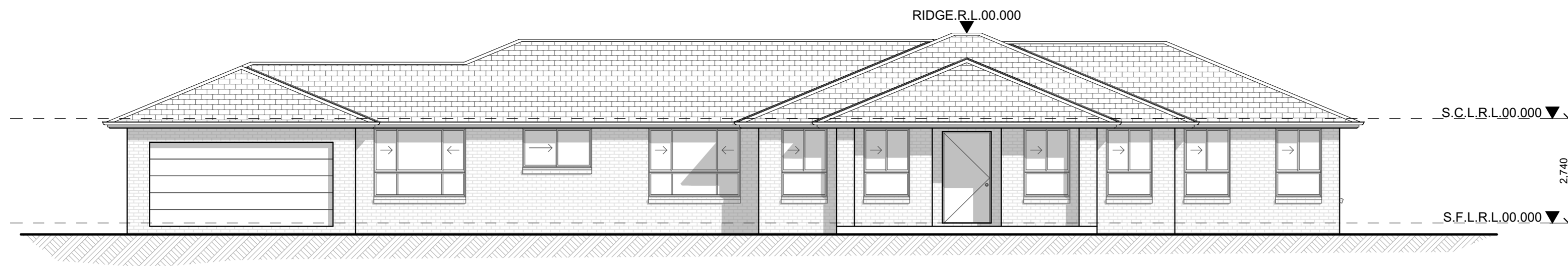
○ Front Elevation Elevation 1 scale 1:100