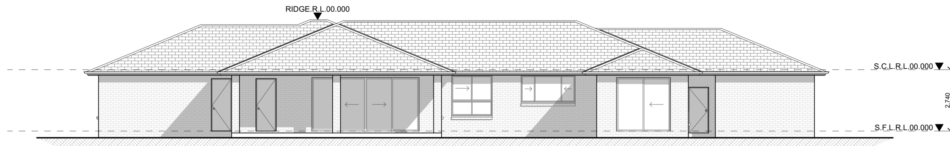
○ Rear Elevation Elevation 3 scale 1:100