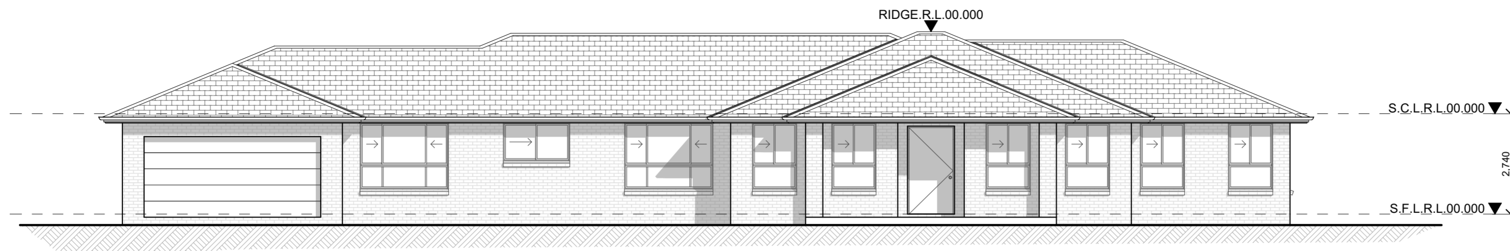
○ Front Elevation Elevation 1 scale 1:100