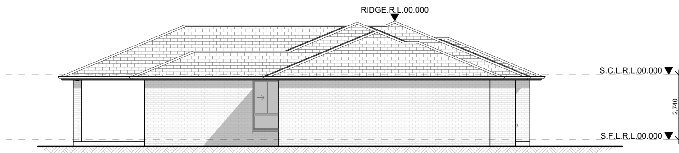
○ Side Elevation Elevation 4 scale 1:100