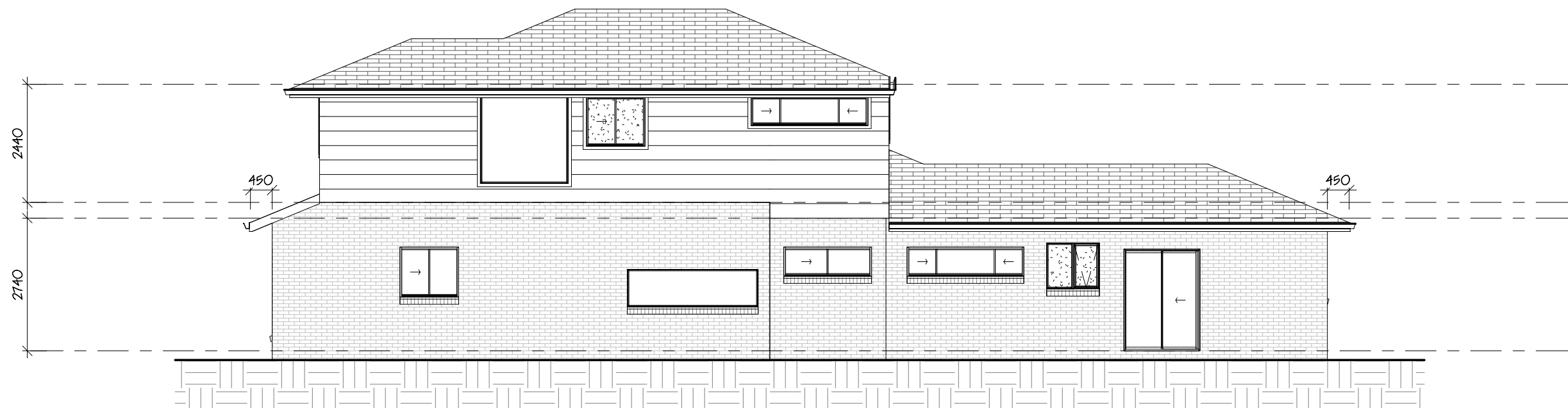
3 Right Side Elevation 1 : 100