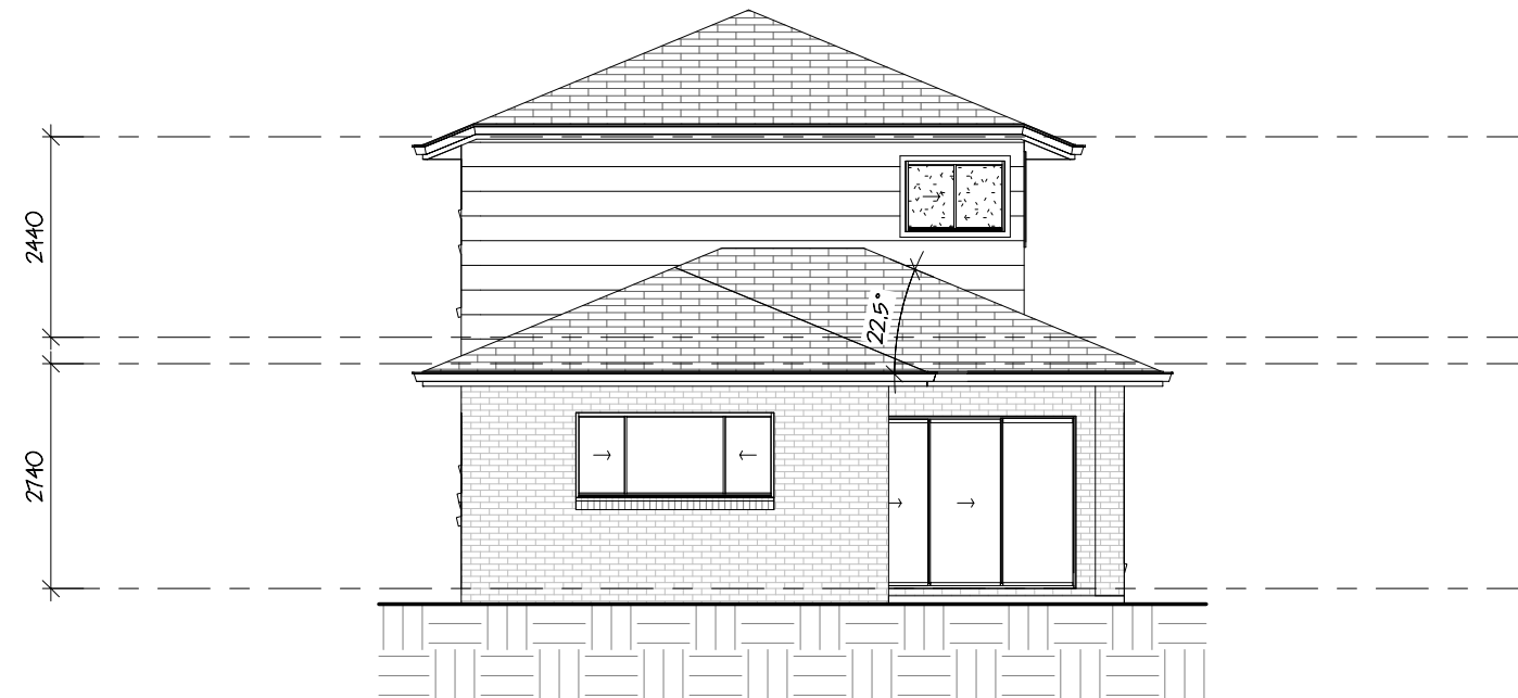
2 Rear Elevation 1 : 100