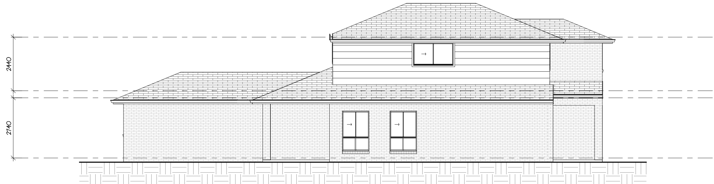
4 Left Side Elevation 1 : 100