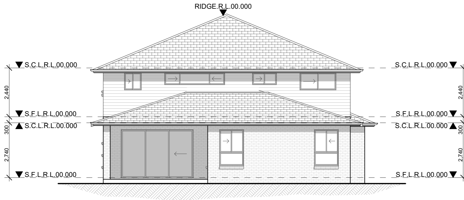
Side Elevation Elevation 2 scale 1:100