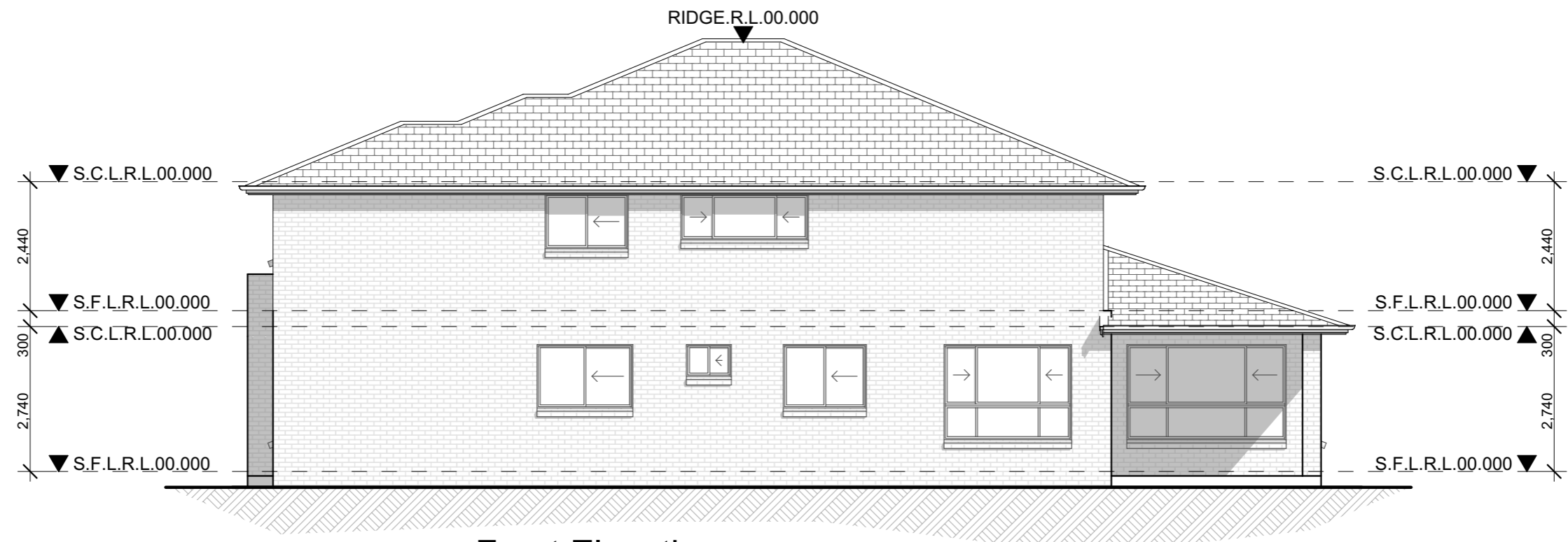
Front Elevation Elevation 1 scale 1:100