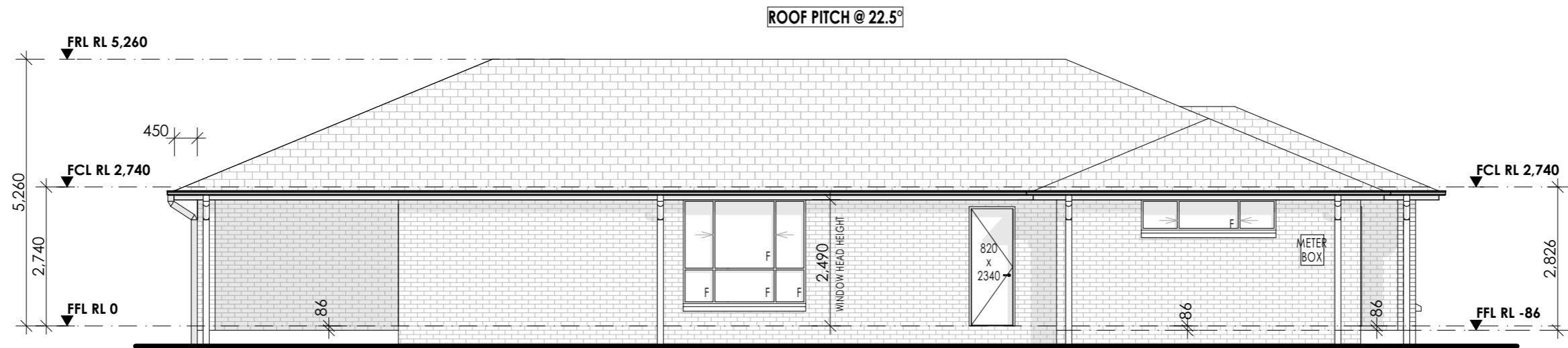
2 Side Elevation Scale:1:100