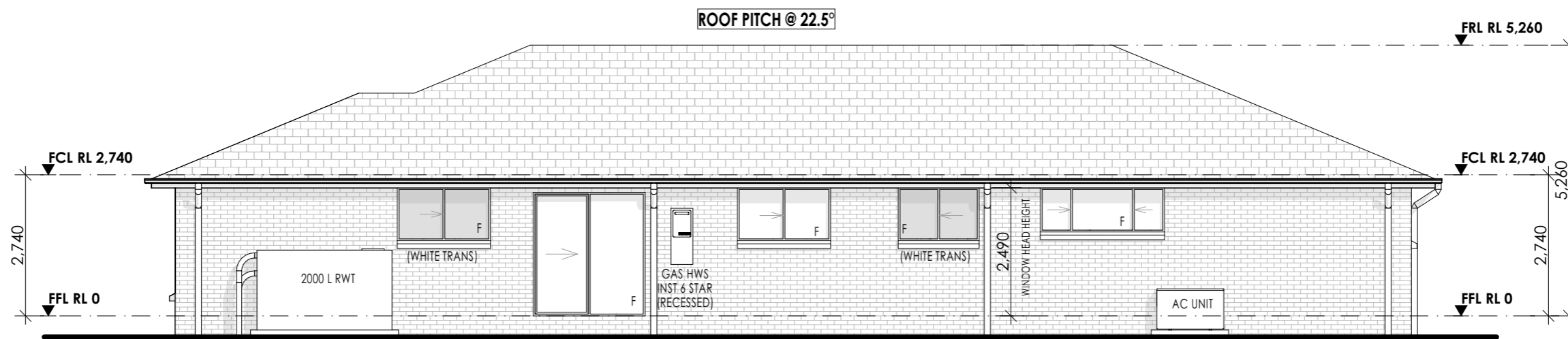
4 Side Elevation Scale:1:100