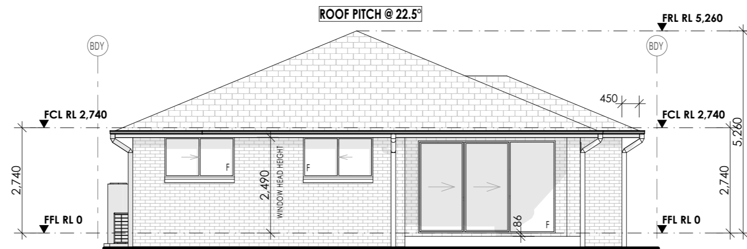
3 Rear Elevation Scale:1:100