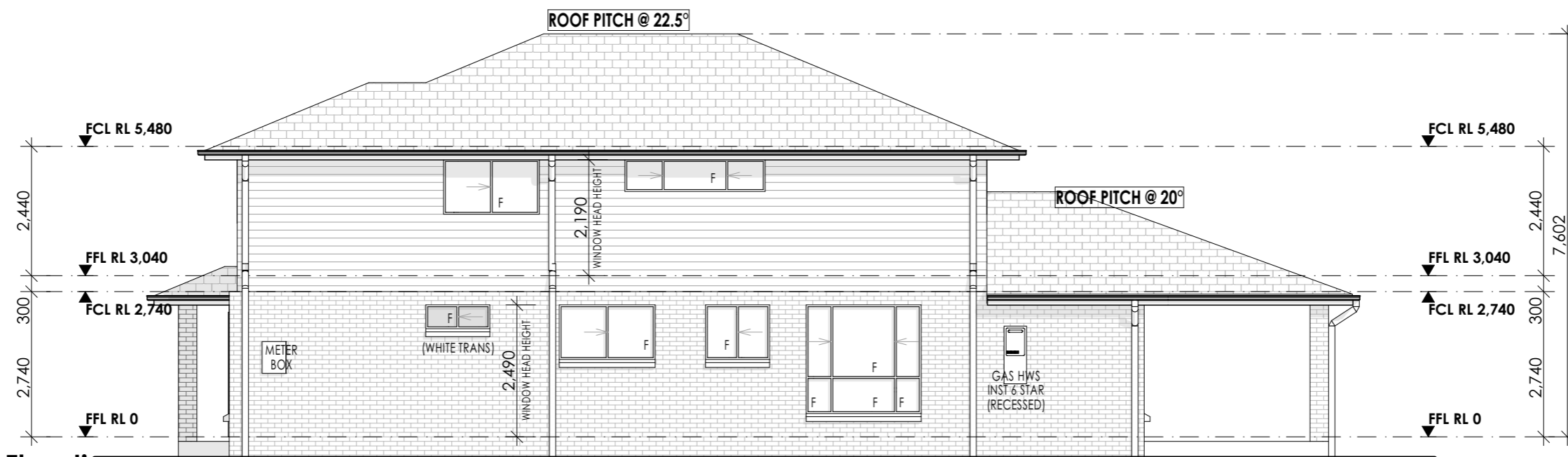
4 Side Elevation Scale:1:100