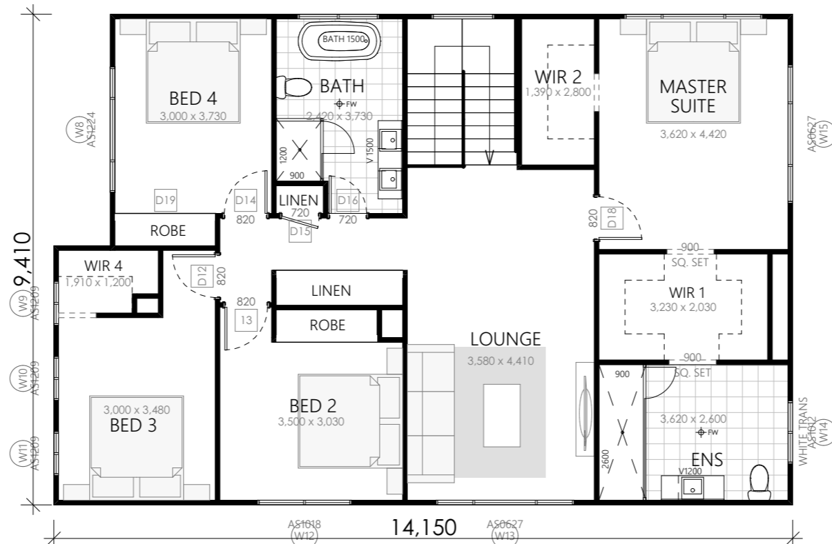
Brochure Plan FF Scale:1:100