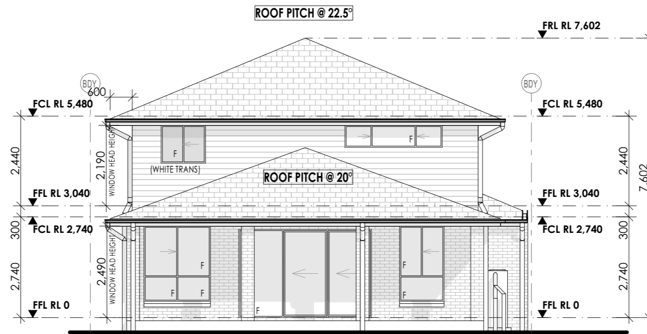
3 Rear Elevation Scale:1:100