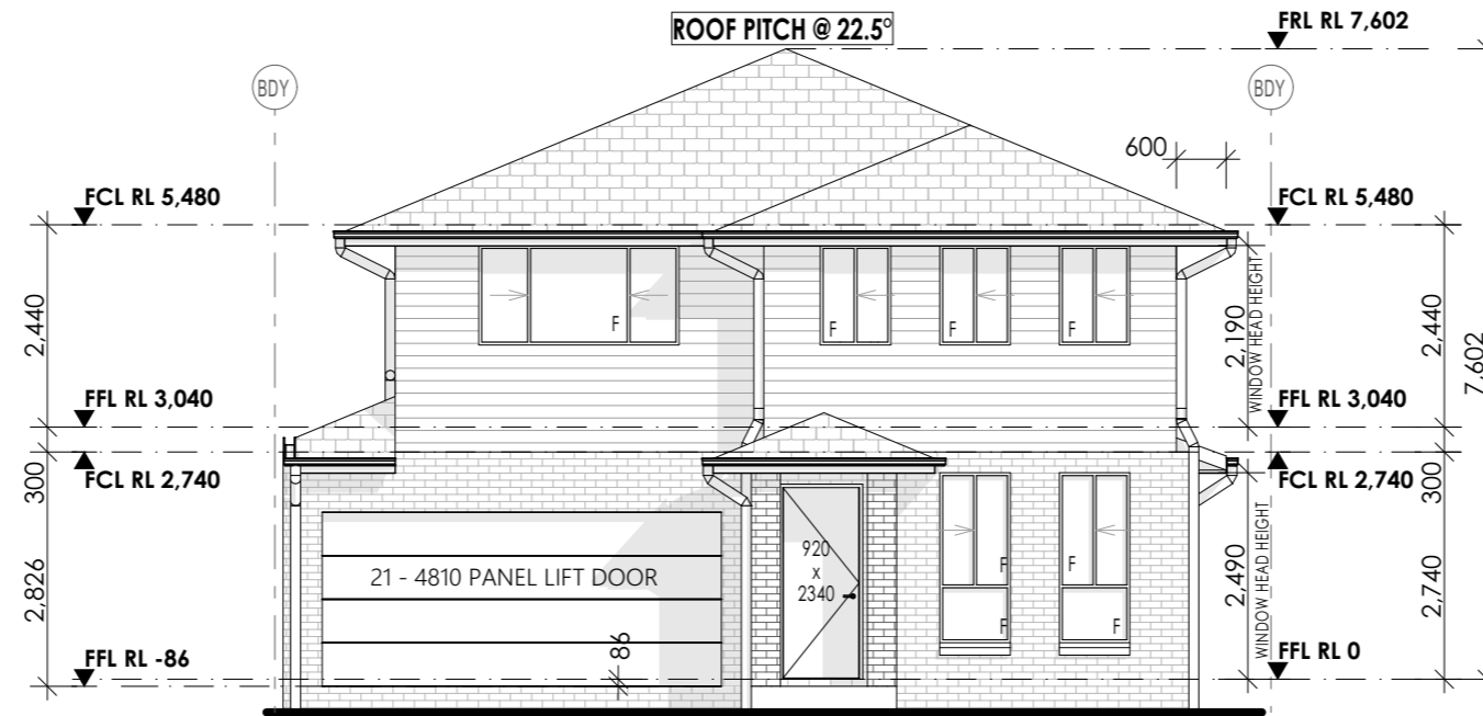
1 Front Elevation Scale:1:100