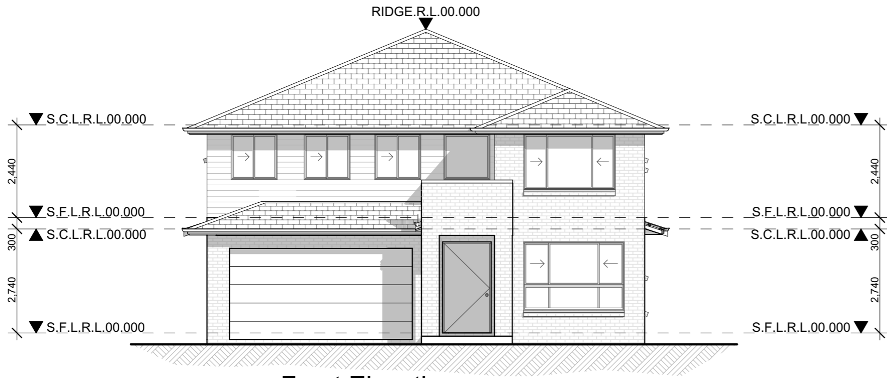
○ Front Elevation Elevation 4 scale 1:100