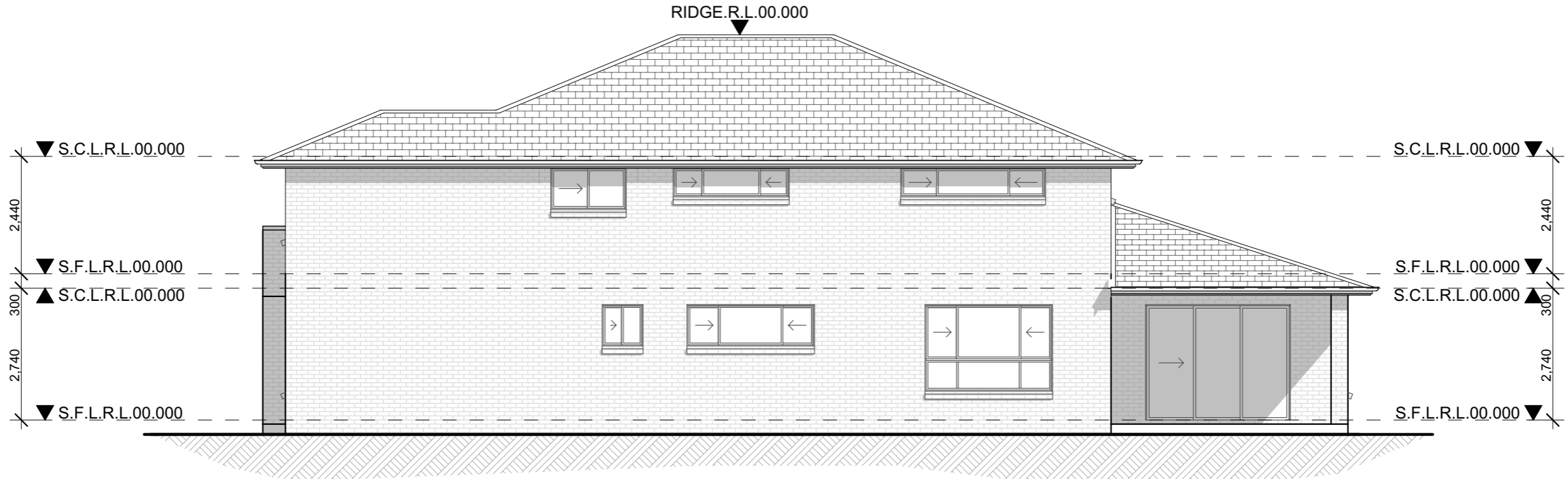
○ Side Elevation Elevation 1 scale 1:100