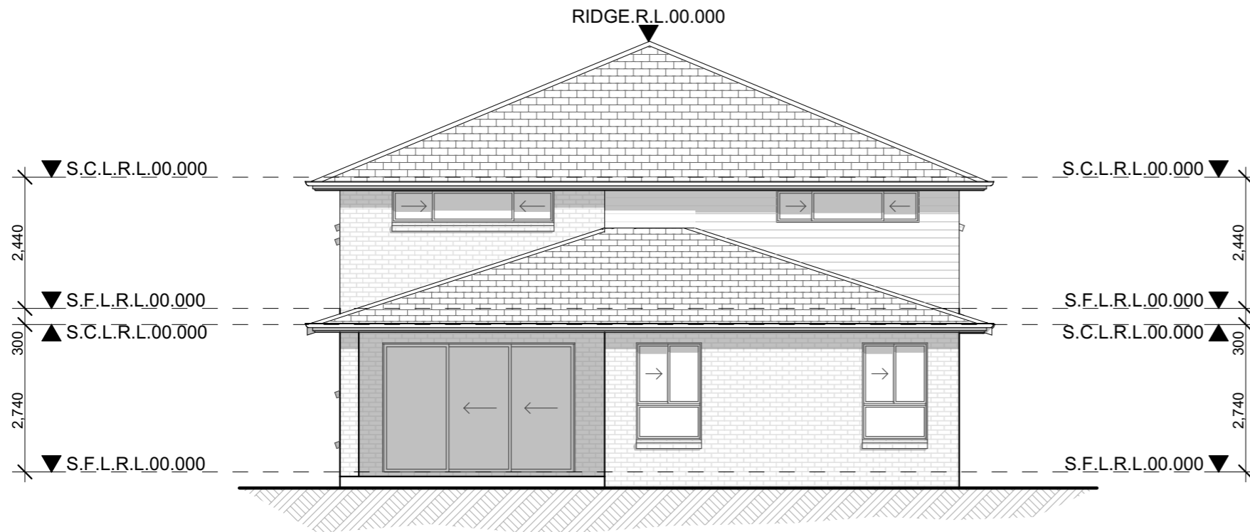
Rear Elevation Elevation 2 scale 1:100