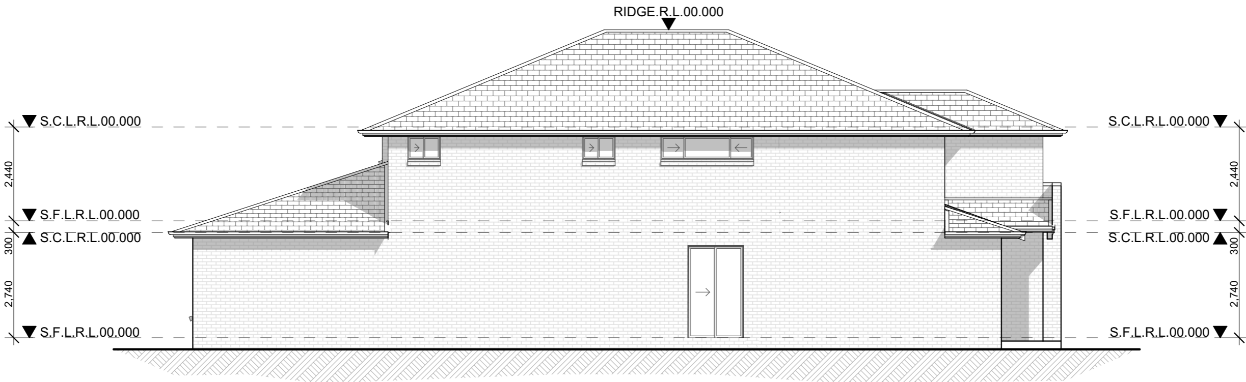
Side Elevation Elevation 3 scale 1:100