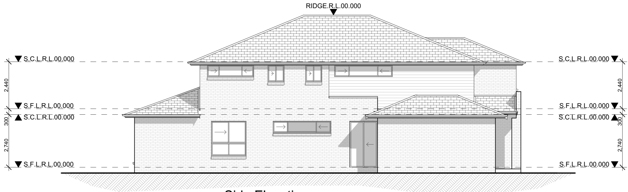
Side Elevation Elevation 3 scale 1:100