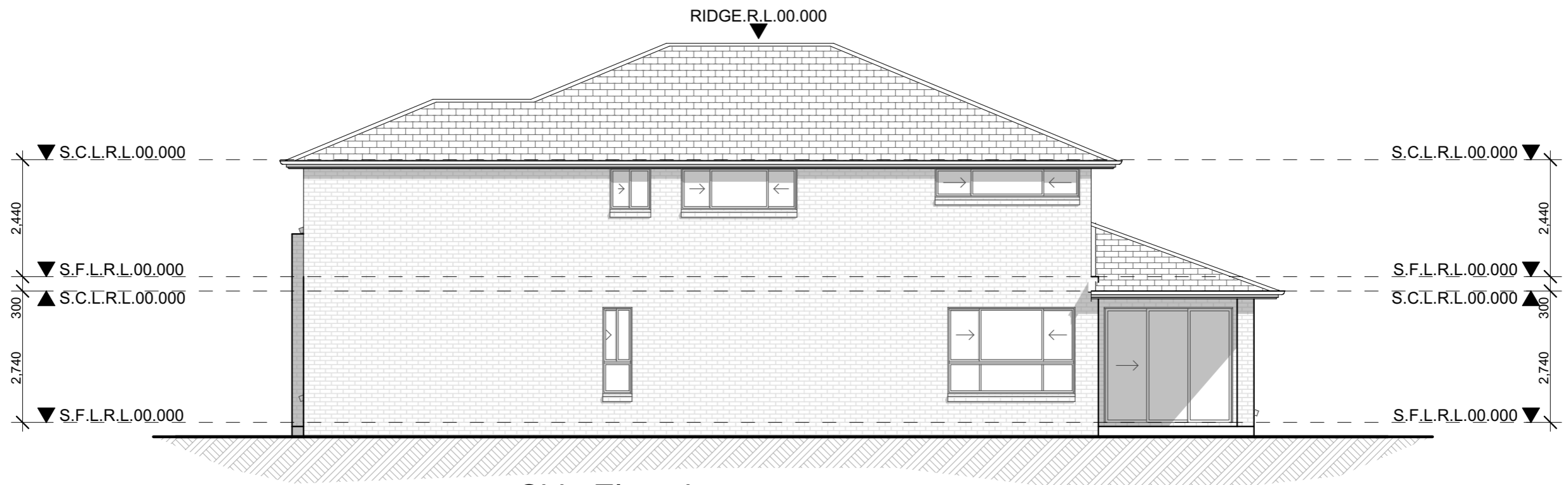
○ Side Elevation Elevation 1 scale 1:100