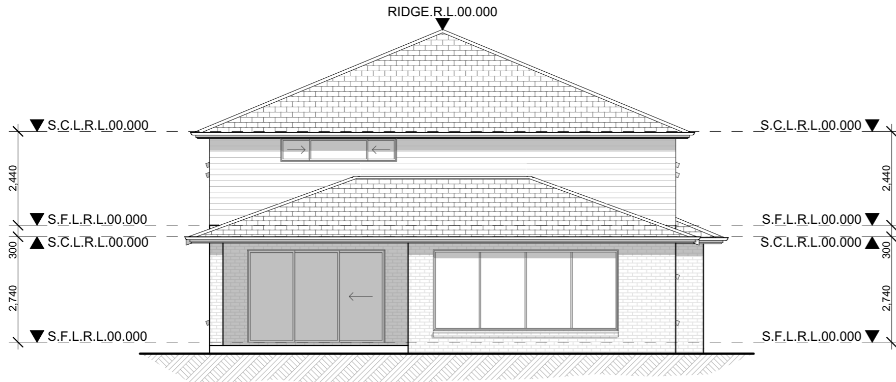
Rear Elevation Elevation 2 scale 1:100