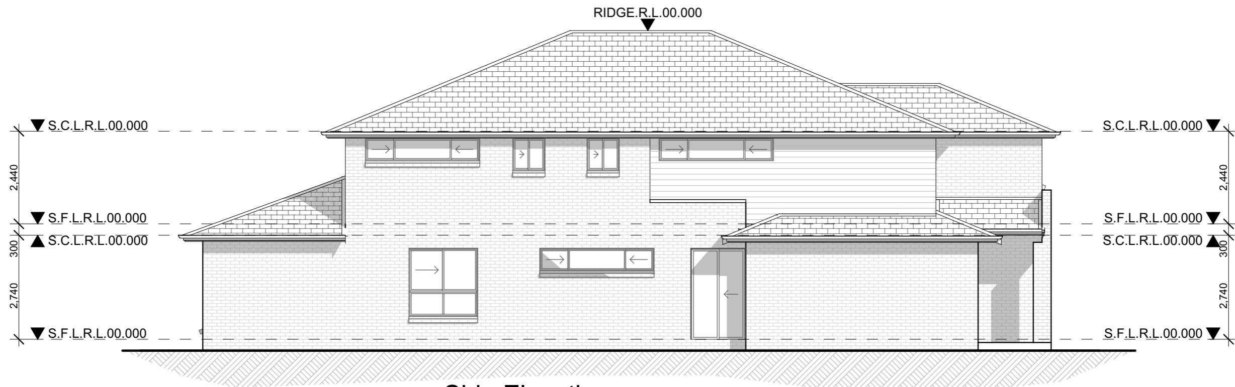
Side Elevation Elevation 3 scale 1:100