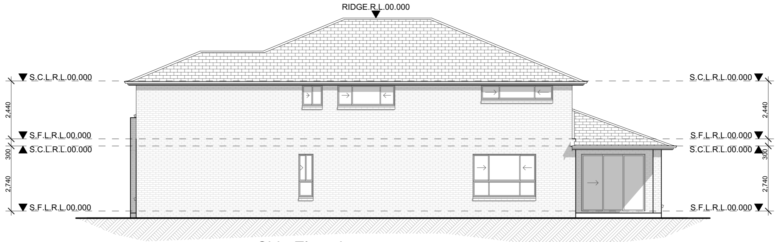
○ Side Elevation Elevation 1 scale 1:100

JR Design & Drafting Residential Design & Drafting Services